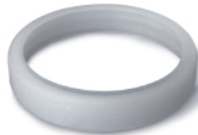
SERIES 40-47 Temperature Range: 275°F intermittent use.