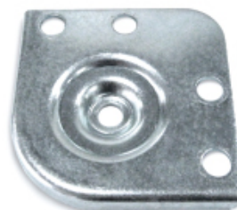
CORNER TOP PLATE

Suited for light duty casters. Finished in a zinc plating finish.