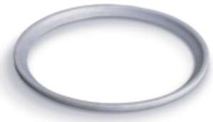
SERIES 70S Temperature Range: 275°F intermittent use.